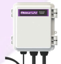
Solenoid Connection Module