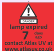
Lamp change warning