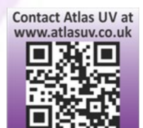
QR code screen