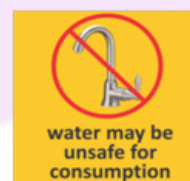
Unsafe water screen